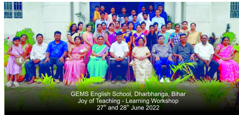
GEMS English School, Dharbhanga, Bihar Joy of Teaching - Learning Workshop 27 th and 28 th June 2022