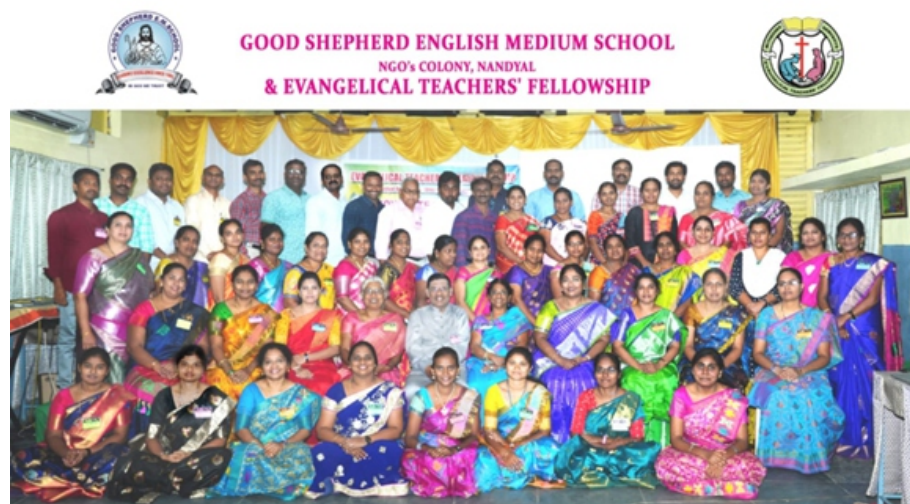
JOY OF TEACHING - LEARNING WORKSHOP 20, 21 & 22 June 2022.